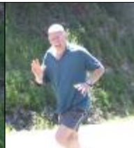
Cheerful Kirk waving at the crowds